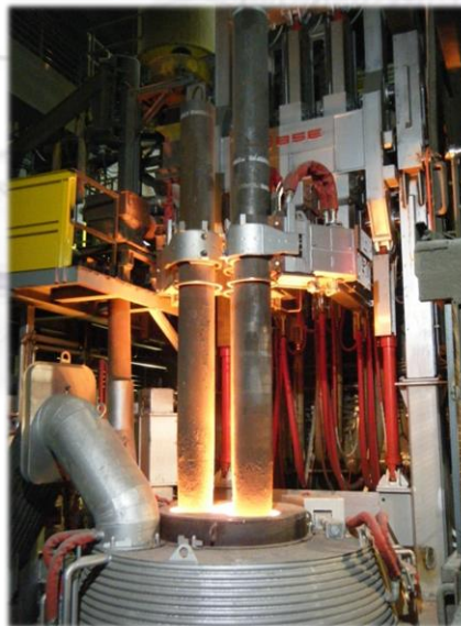
New ladle furnace no. 2 at BSW – layout, after erection, at start-up