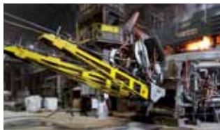
Continuous enhancement based on operational experience of own steel plant BSW