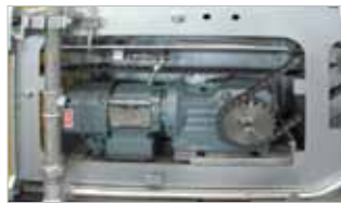
Easily accessible components for optimum performance and convenient maintenance