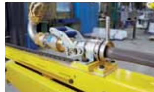
Snap-on coupling for fast and easy lance exchange

Badische Stahl-Engineering GmbH RobertKoch-Straße 13 D-77694 Kehl/Germany Phone (+49) 78 51/877-0 Fax (+49) 78 51/877-133 eMail info@bse-kehl.de www.bse-kehl.de