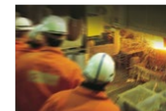
Observation of BSW steel production