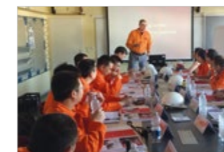
Classroom training with BSE/BSW experts