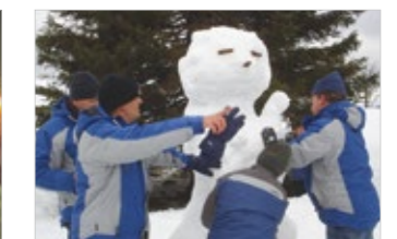
Teambuilding and leisure programme