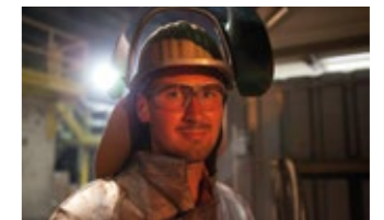
Motivated and qualified people ensure sustainable success of the company