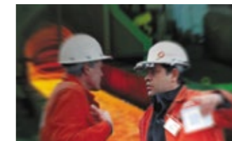
BSE consultants reveal the true potential of your steel plant and rolling mill